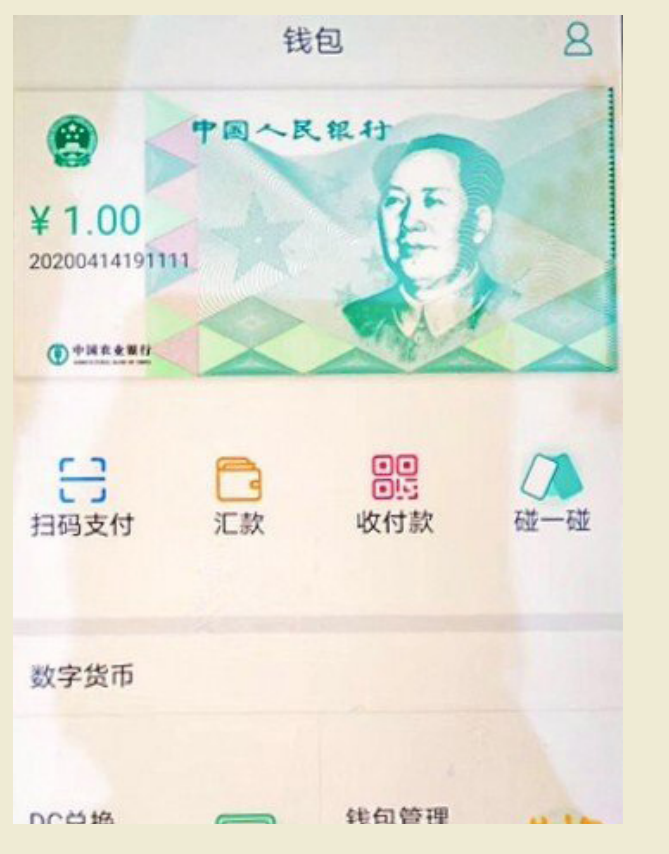
Figure 4: Digital renminbi as intermediated through a platform of the Agricultural Bank of China